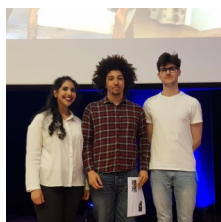
Philosophy Society students gave one of 11 three-minute presentations