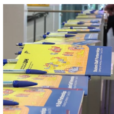
Brochures & pens laid out for 300+ student and staff delegates