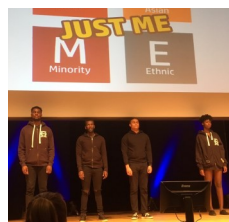
UWL students performed a moving drama about BAME experience