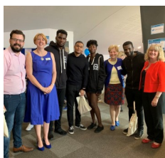
UH hosts welcomed students and staff from the University of West London (UWL)